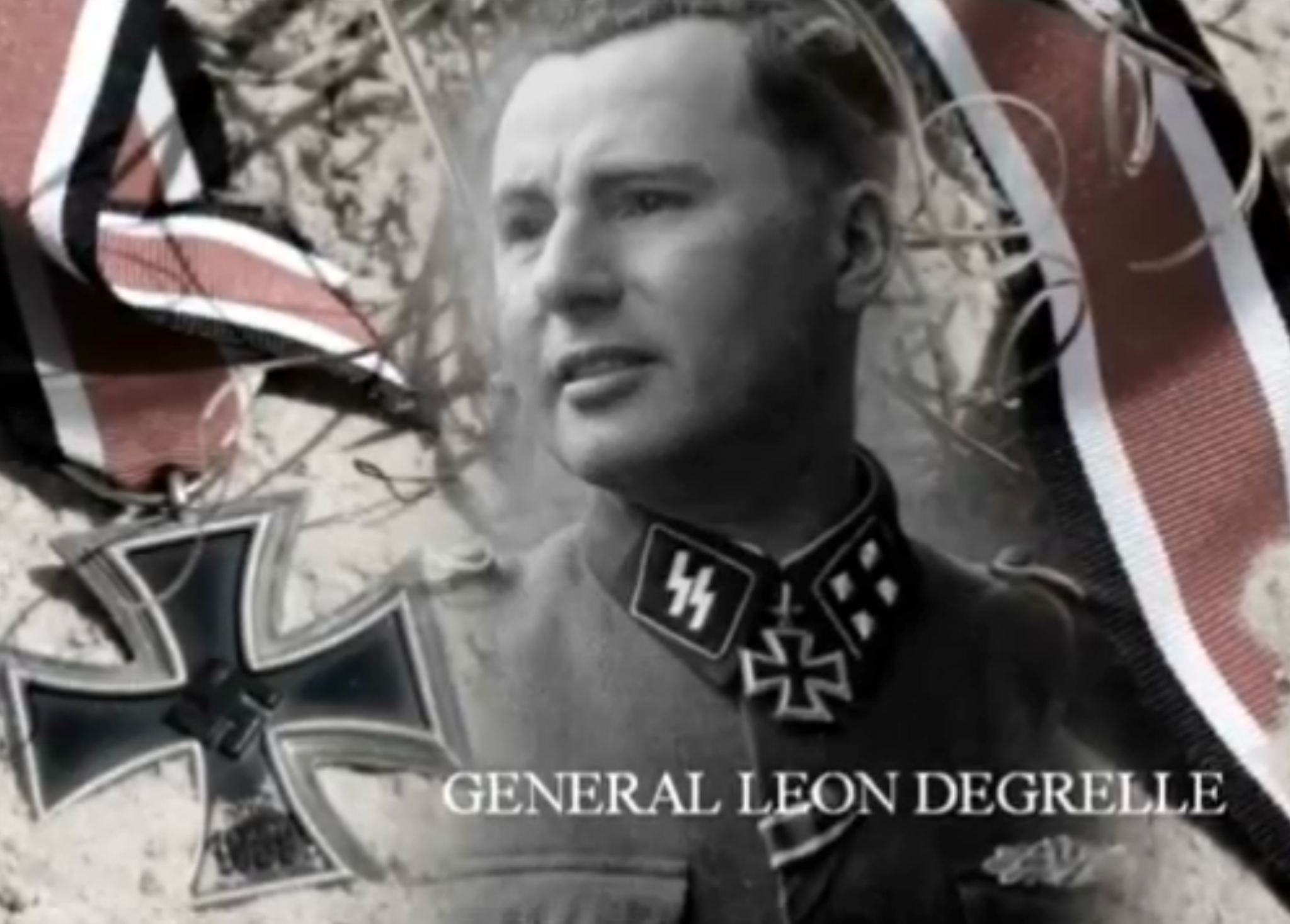
GENERAL LEON DEGRELLE