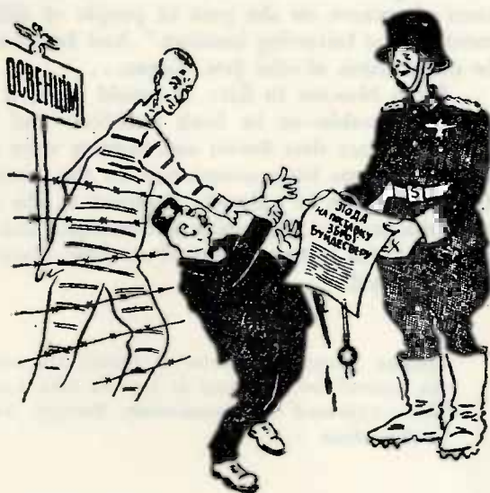
БОНН — ГУРІОН

And that is what happened. After World War II, the Zionists in Palestine discontinued recognizing the supremacy of English imperialism, while the Rockefellers became strongly entrenched. At the present time,