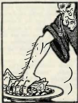
В СИНАГОГАХ НАХОДЯТ ПРСТА- НИЩЕ РІЗНІ ШАХРАІ І ПРОП- ДИСВІТИ

The Jews like to talk a great deal about the Commandment which forbids them to bear false witness. However, when the welfare of a Jew is in question, false witnessing and even false oaths are permissible. . . . While giving a false oath, it is only necessary, the "Holy Scripture" teaches, to negate the oath in the heart and soul, and therefore the oath is meaning-