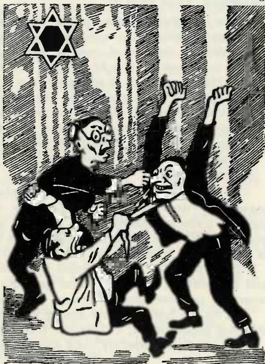
ХАПУГИ-СЛУЖИТЕЛІ СИНАГОГ НЕРІДКО ЗЧИНЯЮТ БІЙКИ З ПРИВОДУ ПОДІЛУ ЗДОБИЧІ

Left: "All sorts of swindlers and cheats find refuge in the synagogue" Right: "The swindlers in religious articles brawl among themselves over the division of the spoils in the synagogue"