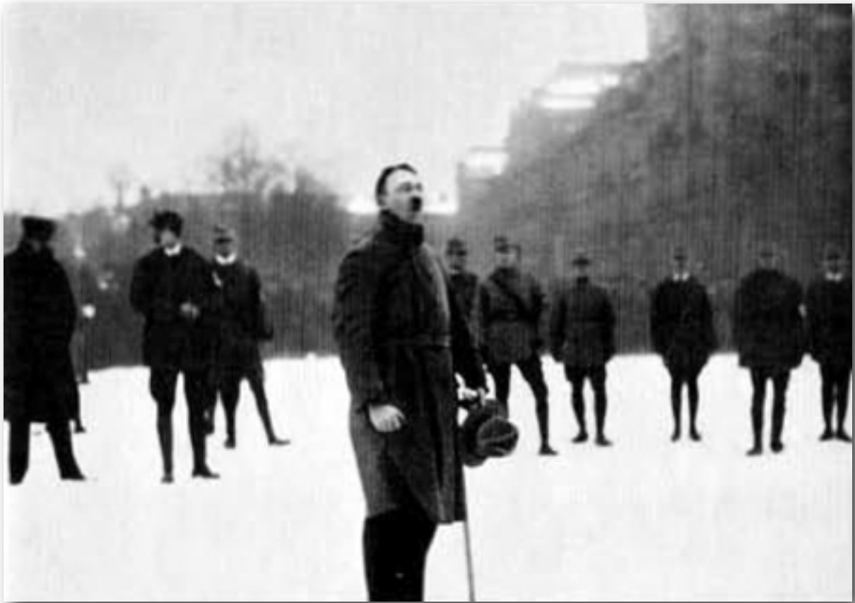
[Image] “On January 28, 1923, the first National Socialist Party Congress was held on the Marsfeld in Munich ...”

On February 24, 1920, he was at last able to hold the first mass meeting, in the Hofbrau Haus. It was on that occasion that he promulgated and expounded the Programme of the German National Socialist Workers' Party. An attempt on the part of the communists to wreck the meeting was frustrated by a handful of Hitler's former war comrades, who had taken on themselves the responsibility for maintaining order. Hitler's contention that the Marxist terror should not only be smashed by mental weapons, but also by physical force, was proved for the first time at this meeting.