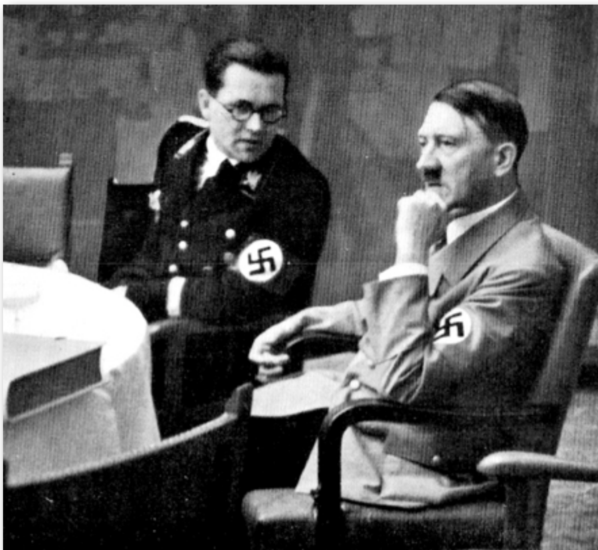
[Image] Adolf Hitler and Philipp Bouhler, the author of this biography.

To understand all this one must understand and appreciate the character and personality of Adolf Hitler himself. Broadminded and big-hearted and just, capable of bringing iron logic to the support of his arguments, judicious and courageous in making decisions, and yet