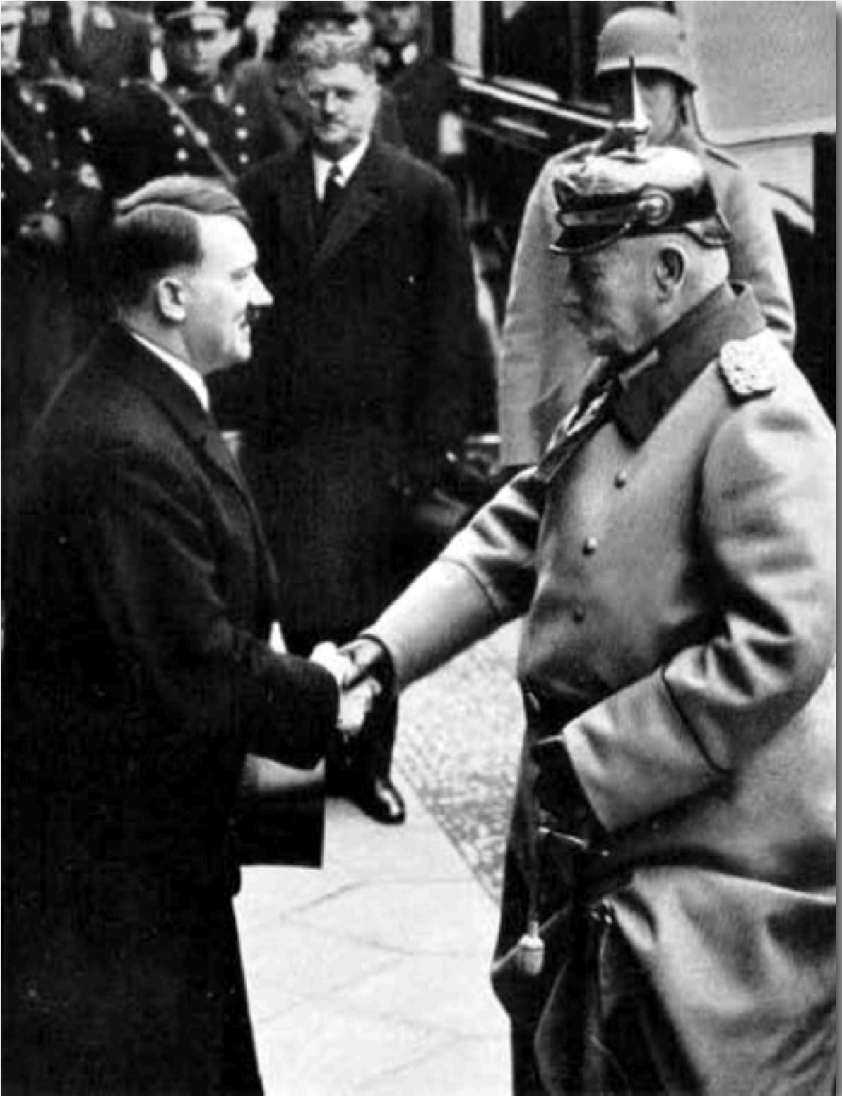
[Image] The late President Von Hindenburg and Adolf Hitler in 1934.