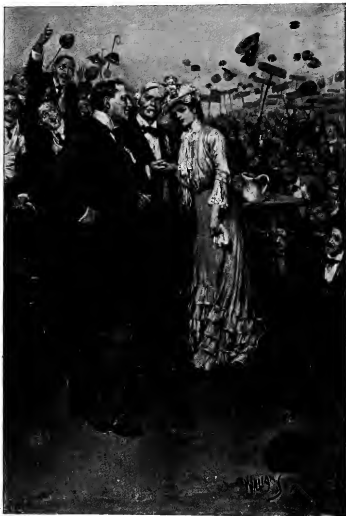
"TWO THOUSAND MEN WENT MAD."