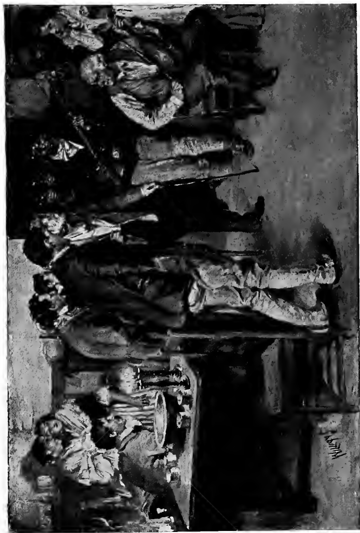
"COME ON BOYS!"