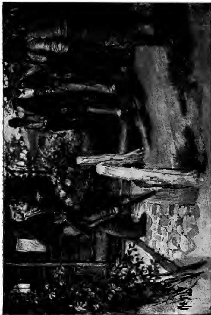
"I'LL KILL THE FIRST NIGGER THAT CROSSES THAT LINE."