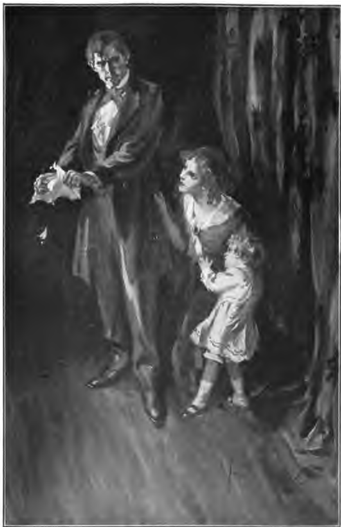
“He had heard the call of his people.”