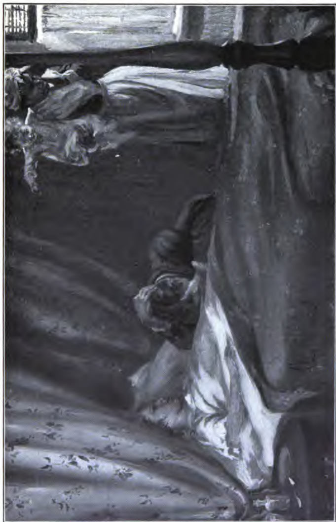
"From the doorway he waved his chubby little arm."