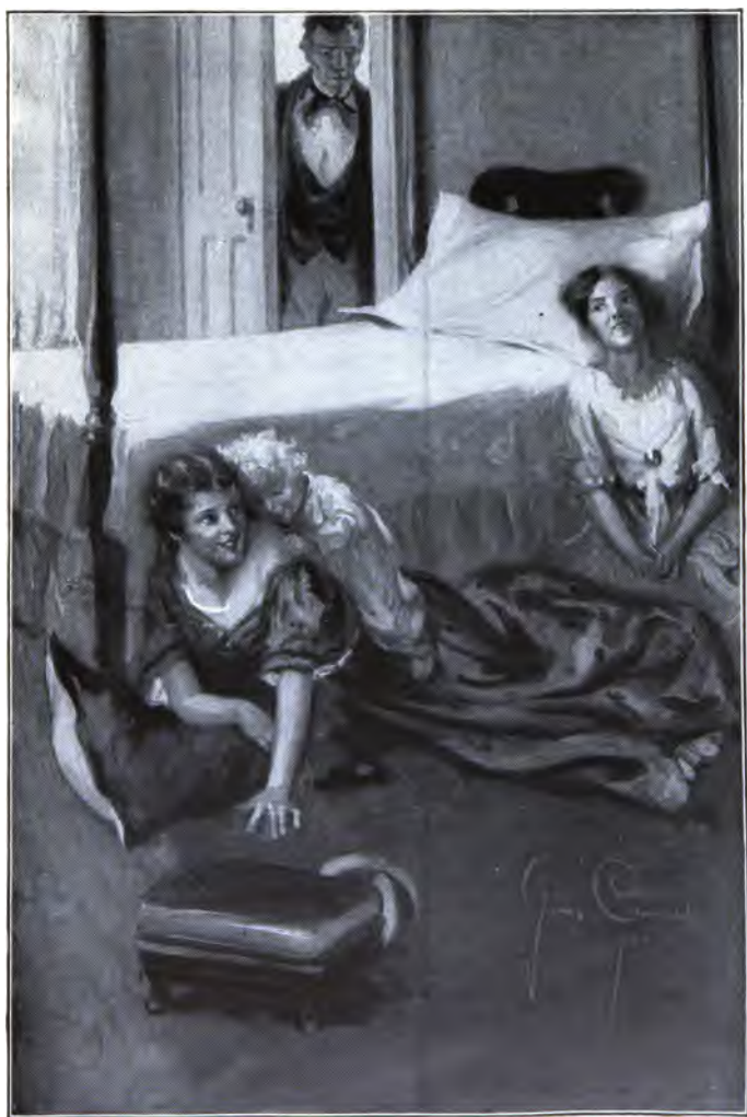
“Sitting astride her back, laughing his loudest.”