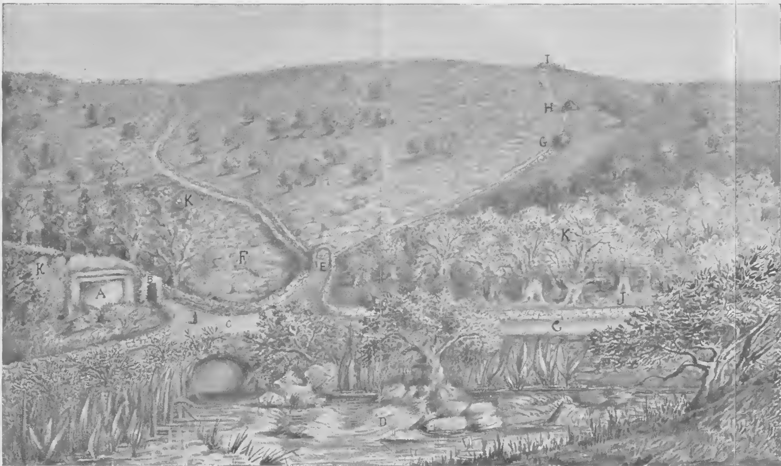
MOUNT OLIVET (WEST SIDE) AND GETHSEMANE.