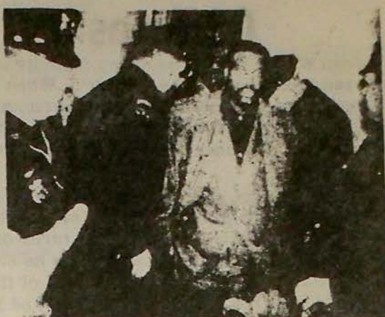
SOURCE OF BLACK NATIONALISM. New York cops bust into apartment of Harlem rent striker and haul him off to jail. Brutality by cops and their zealous defense of rent-gougers and other moneyed interests have fed growing nationalist mood in black ghettos.

What about those who see only one side of this dual character,