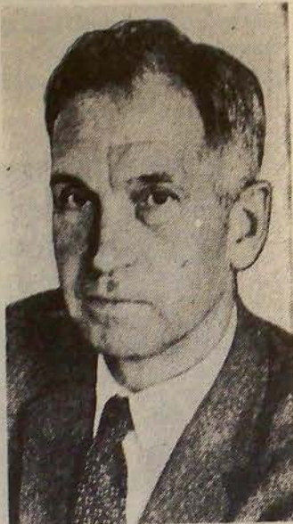
OUTLOOK DIM — Zoologist Ernst Mayr, who believes that life will persist on the earth but man won't.

"Man's ability to control the environment was said to be his biggest advantage over other species," Mayr said.