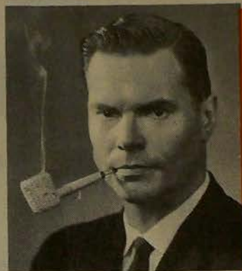
George Lincoln Rockwell Feb - March 1967