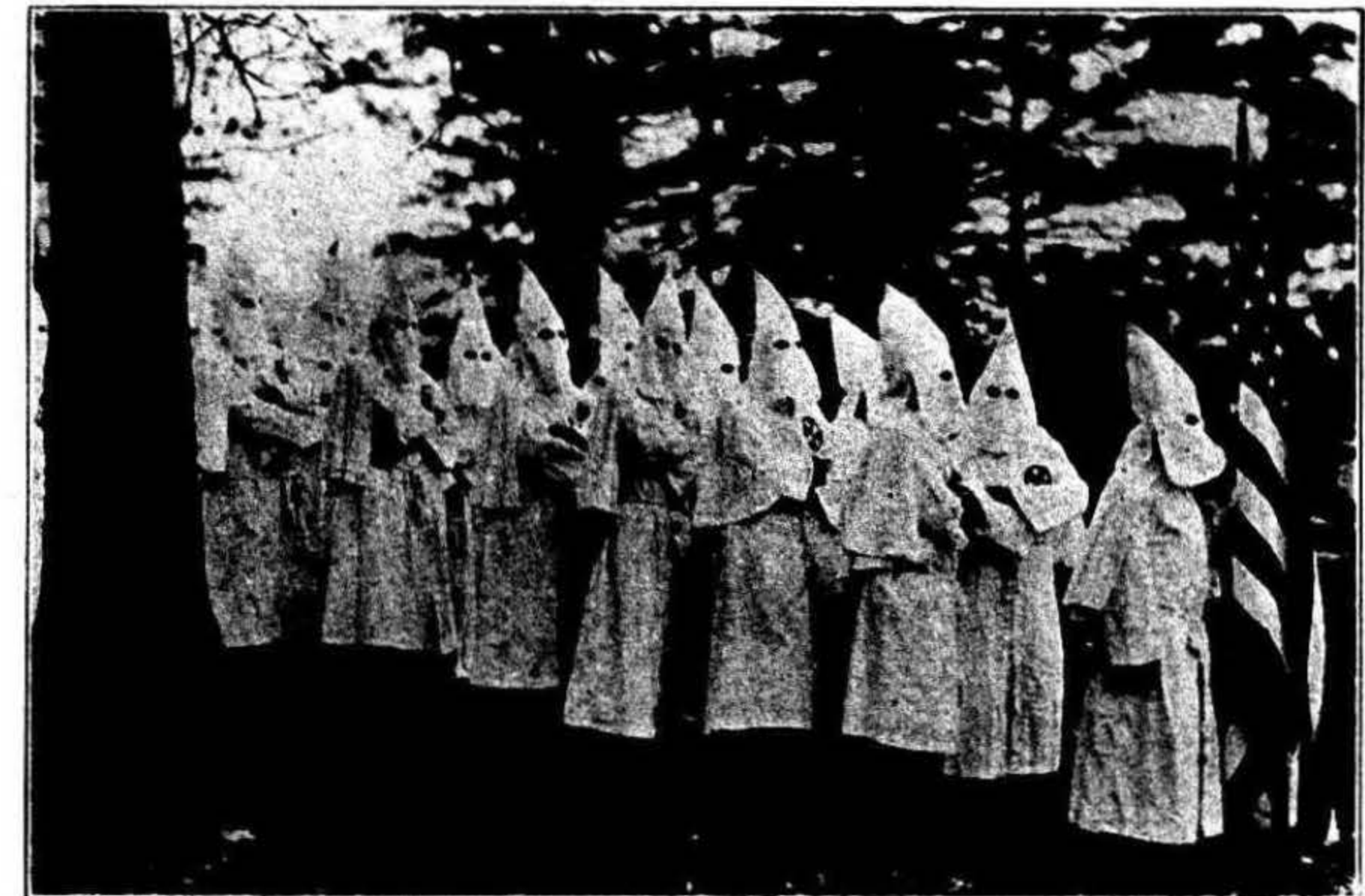
KLUXING IN THE HILLS OF KENTUCKY

Give people full and complete information on every candidate, who and what he is. Tell men facts about all issues from