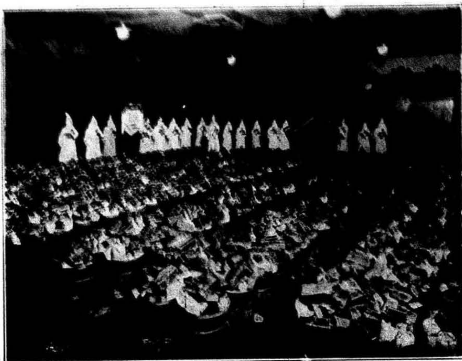
THE KLAN PLAYS SANTA CLAUS TO THE POOR