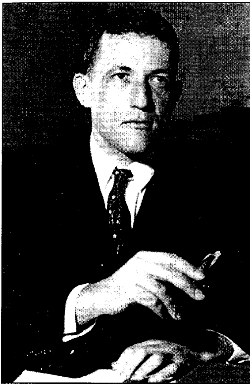
LAWRENCE DENNIS DECEMBER 25, 1893 – AUGUST 20, 1977