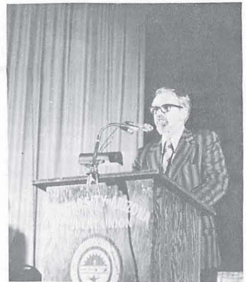
Dr. J. Allen Hynek at the APRO UFO Symposium.

Photographs of the participants of the APRO UFO Symposium are shown below and on Page Nine with appropriate captions.