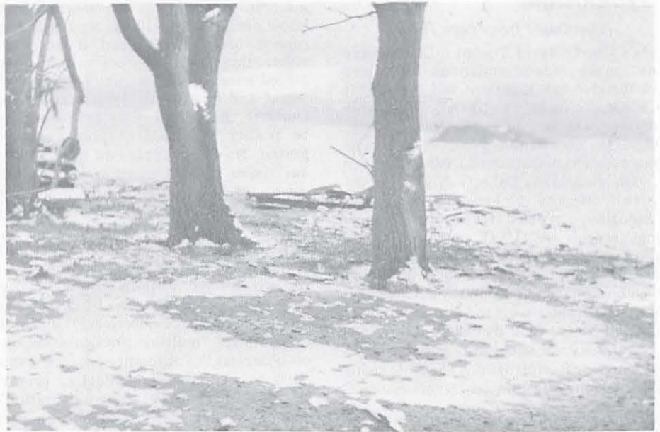
Shown above is the ring described in the Kansas landing case. See page 1 and left.