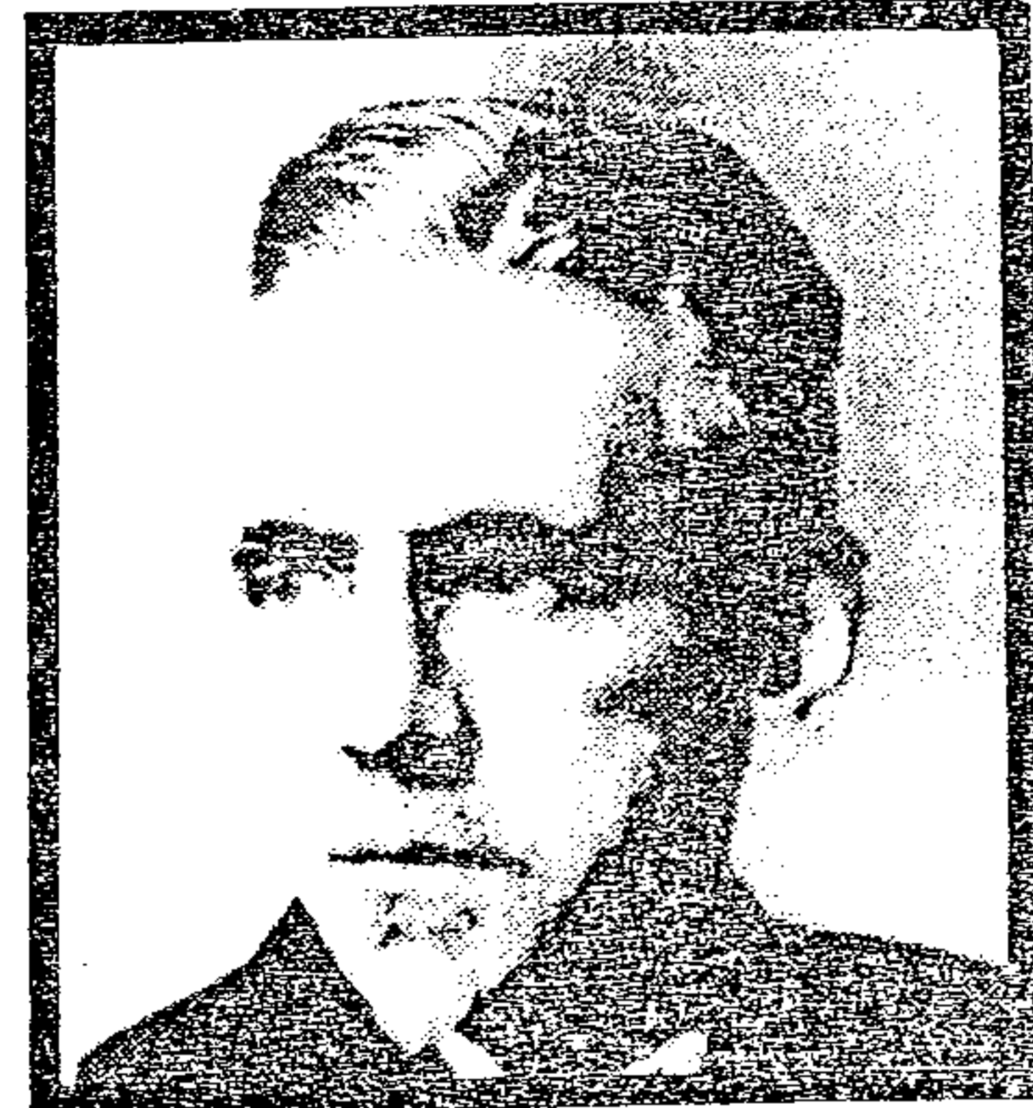
William Dudley Pelley, National Commander Silver Legion Rangers of America

The theater business being by this time well-nigh a Jewish monopoly, it is of course not difficult to get such a play promptly put into production.