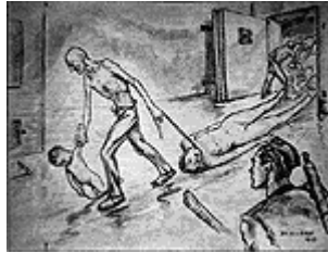
An 'eyewitness' drawing of a Jewish Sonderkommando and a German guard, both immune to Zyklon-B!

How can 'eyewitness' tales of Jewish prisoners working as 'Sonderkommando' dragging bodies from the 'gas chambers' be true? None of these stories mention gas masks and some even say the Sonderkommando were smoking cigarettes IN A CHAMBER FULL OF EXPLOSIVE POISONOUS GAS.