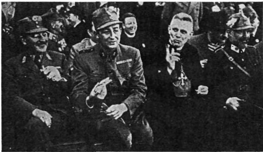
Left to right: DR. SCHUSCHNIGG, PRICE STAREMBERG AND CARDINAL INNITZER SMILE THEIR APPROVAL OF DOLLFUSS.