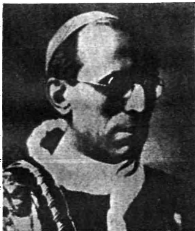
EUGENIO PACELLI—HOW POPE PIUS XII

The idea of a Chief of Christendom, himself also a Chief of State, presiding over an assembly of Chiefs of State, is a medieval conception which has no place in our twentieth-century democratic world. It has been revived for political reasons, and unless denounced, will prove a dangerous challenge to freedom and progress. For just as the equality of individuals, the equality of nations is a fundamental principle of democracy.