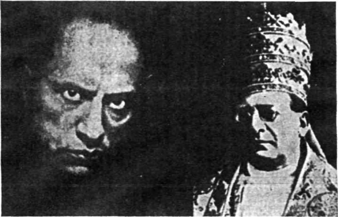
IL DUCE MUSSOLINI

Pope Pius XI styled Mussolini . . . "a gift of Providence, a man free from the prejudices of the politicians of the liberal school."