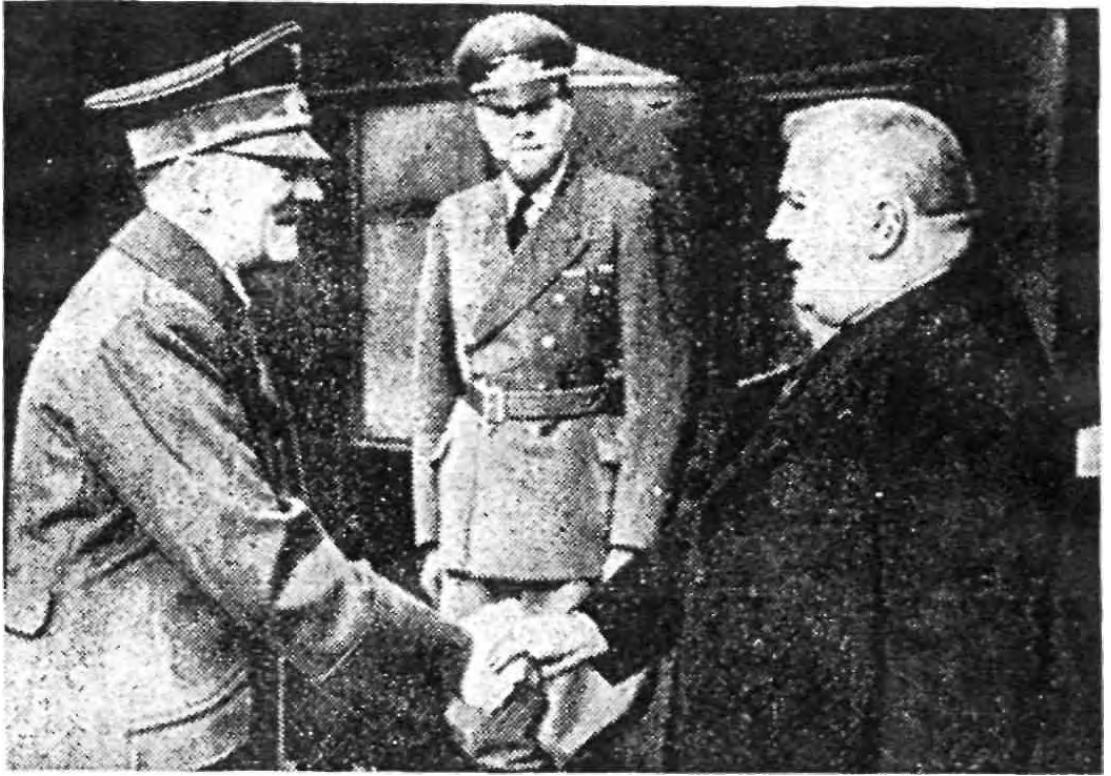
Reichsfuehrer Hitler greets the Rt. Rev. Msgr. Joseph Tiso, Slovakian Chief of State, Papal Chamberlain and Roman Catholic priest, at Hitler's field headquarters on the Eastern Front, October, 1941.

sistance, utterly destroying national unity, confusing and demoralizing the people at the very moment when German troops on the Austrian border at Bratislava stood ready for the occupation of the Slovak capital.