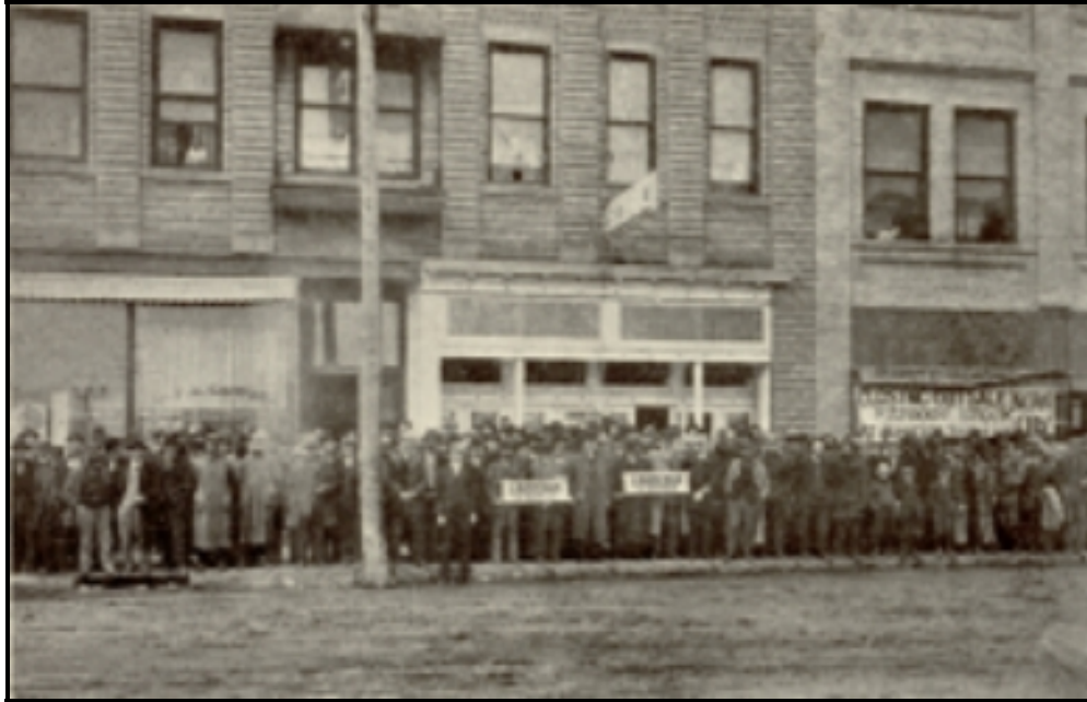
Lindbergh-for-Governor meeting at Detroit Lakes, Minnesota, April 26, 1918, Lindbergh standing between banners.