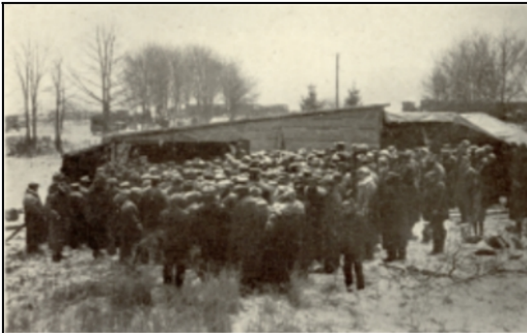
County Nonpartisan League Meeting held in machinery shed at Echo, Minnesota, because of refusal to allow meeting in town.