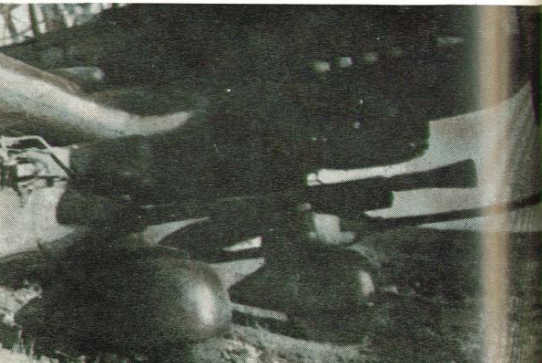
"For extra punch two 37 mm cannon were mounted under the wings of our JU 87 (Stuka)."