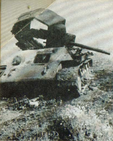
"A perfectly exploded Russian tank (T 34) after direct hit by a Stuka."