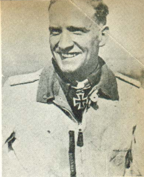
Hans Ulrich Rudel

A German dive bomber (Type JU 87) in the air.