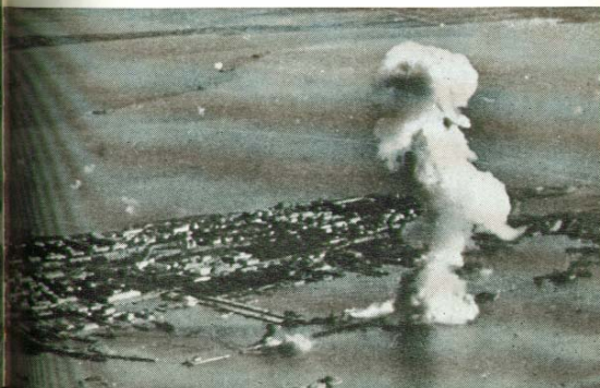
"Twelve hundred feet high rises the cloud from the dying 'Marat'."