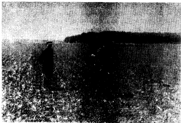
Russian agronomist (on left) and the author.

The results in increased india rubber production were quite satisfactory. One of our superiors went to Russia, and returned with a number of scientists. They came with their families and worked for us as civilians, enjoying their work.