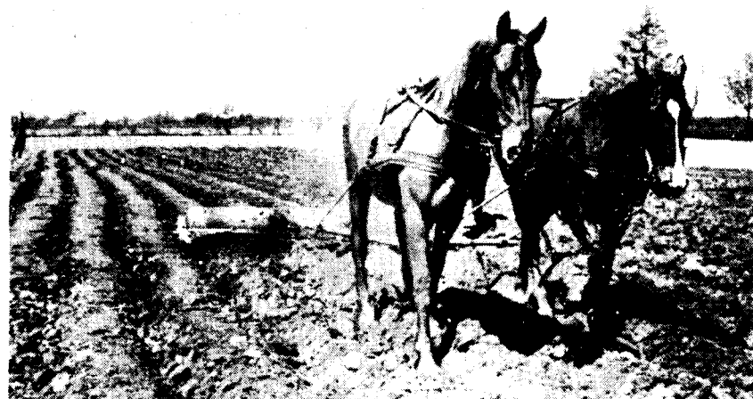
Inmate working in fields (almost hidden by horses). Note only one single guard at great distance, in far left of photograph.

But Detachment 11 also had a secret supply source. The most wonderful things were found by them in unknown hiding places. In the night these were replenished by friends of the inmates. Sometimes these friends even donned inmate attire and marched into the camp, allowing an inmate to take a few days off. Auschwitz was located in Poland and the population helped the inmates as much as possible, though this was officially not permitted.