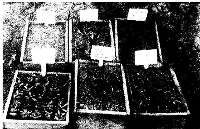
Kok-Sagis plants in various stages of development.

I had been commisssioned to pick 100 workers for hoeing the Kok-Sagis plants. At roll call the inmates were asked if they were interested in this kind of work and if they had done it before. Then followed the "selection" of the workers. This "selection" was later completely misinterpreted. The purpose was to give the inmates something to do and they themselves wanted to be occupied. Selecting them meant