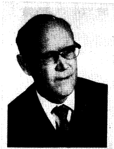
Author as he looks today.