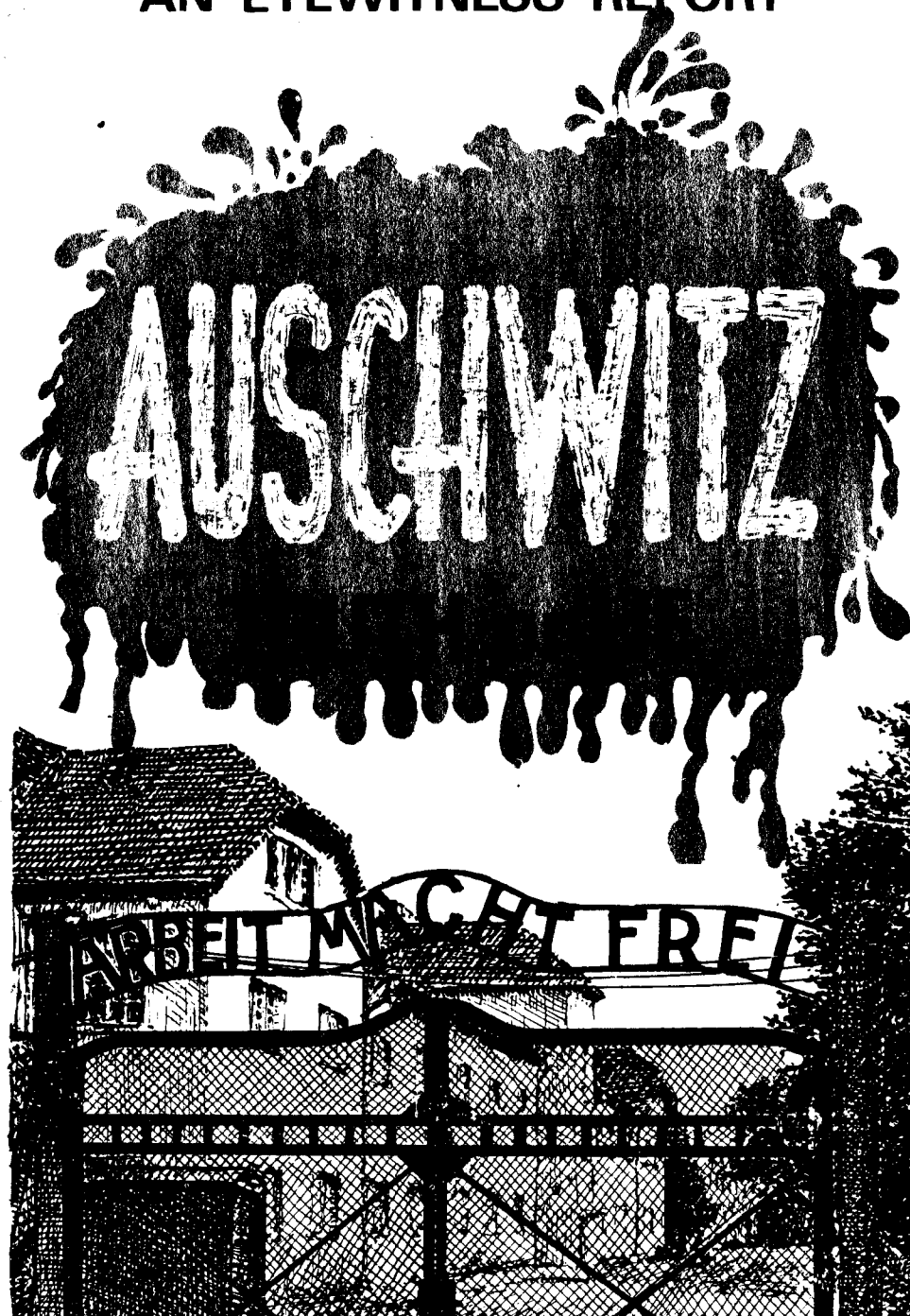
Das Tor zum Konzentrationslager in Auschwitz