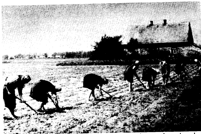
Women inmates working Kok-Sagis fields. Note absence of guards and standard attire of women.

The fact was, however, that in Auschwitz there were more people than were jobs. Naturally, I was concerned with getting workers who had experience on farms. Jews, of course, were not experienced for any kind of farm work, whilst on the other hand, Poles were excellent farm workers. Gypsies were entirely useless. Detachment 11 — that was the name of our female workers from Birkenau — came every day to work in the fields that lay beyond the outer line of posted guards. I dealt with these people almost daily and listened to their complaints. On one occasion I saw an SS-guard kick a woman. I confronted him about this. He claimed