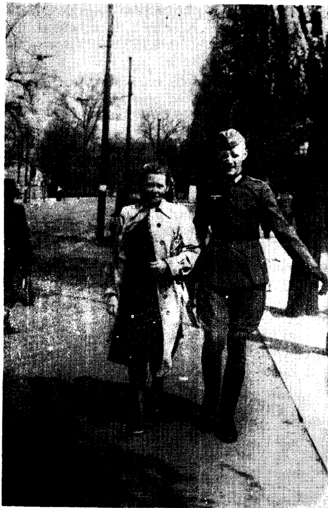
Author and wife on leave in the East. 1944.

"Kanada" was kept under guard at all times to prevent looting from the outside. In our weather station we had a female SS-worker who, on one occasion, "organized" a pair of stockings for herself from "Kanada". She was court-martialled for "plundering". However, the inmates themselves, who worked there, stole constantly.