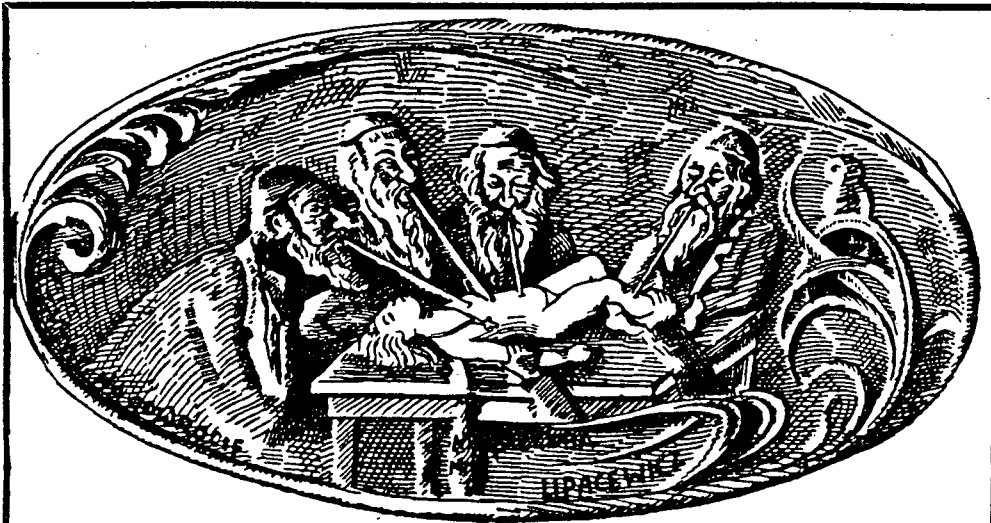
In Brosingen (Hungary) the Jews opened the veins of a wheelwright's child and sucked his blood. (Drawing after a Polish plaque)

"This secret of the blood is not known to all the Jews, but only to the Chakam (doctors) or the Rabbis and the scholars, who therefore carry the title 'Conservatori del mistero del sangue' (Conservators of the mystery of blood!). They pass it on by word of mouth to the Jewish fathers. They in turn reveal it to their sons who regard this as a great honor. At the same time they