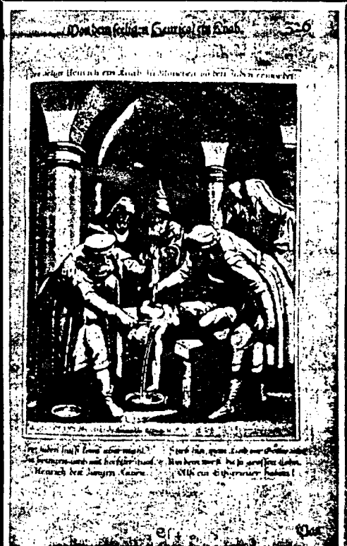
The Ritual Murder of the boy Heinrich in Munich in 1345. He was canonized by the Church. (Photograph from the book "Bavaria Sancta")

This, however, was not the end of this extraordinary case. In 1918, Marxist Jews under the leadership of the Jews Viktor Adler, Otto Bauer, and Julius Deutsch revolted. The Jews remembered their racial comrade Hilsner. The prison doors were opened to him and the murderer and human butcher was joyously greeted and put into a Jewish old folks' home. (!!) Several years later he died and was buried in an honorary grave in Austria at the "Central Israelite Cemetery". In this case, which was proven beyond a doubt, the Jews proved themselves to be in support of ritual murder. Yes, besides that it honored the criminal. Once again Jewry proved itself to be nothing but a gang of organized criminals.