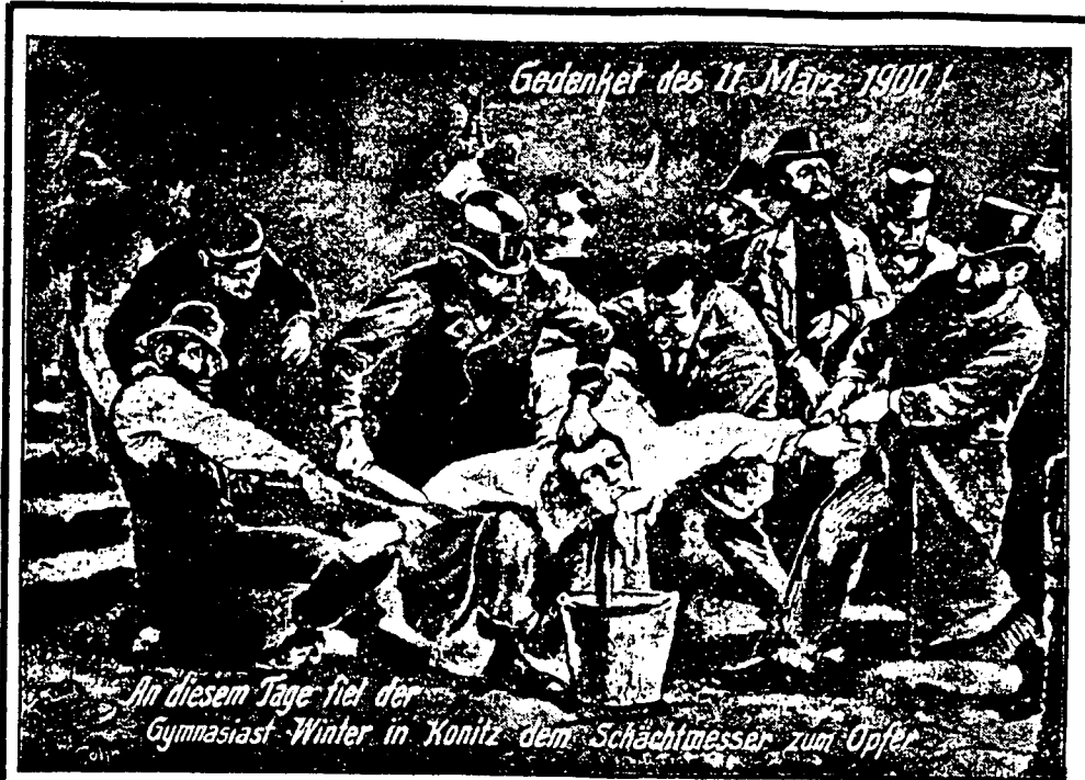
Postcard of unknown origin distributed to commemorate the Ritual Murder at Konitz.