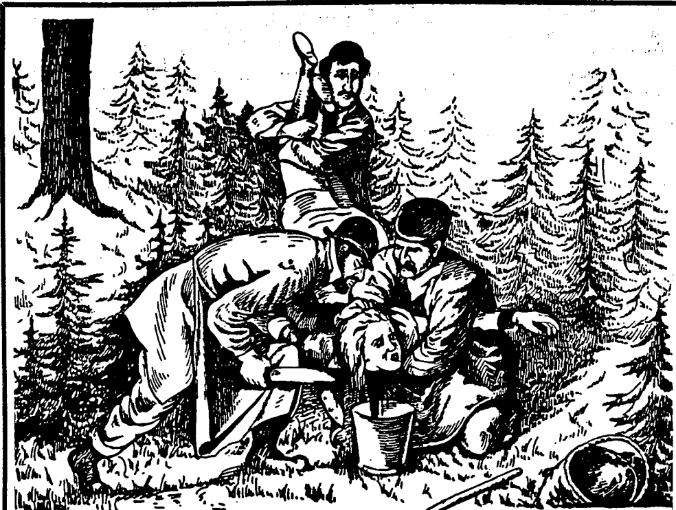
The Ritual Murder at Polna Postcard of unknown origin distributed to commemorate the Ritual Murder at Konitz.

Even today the Jews are celebrating similar Purim festivals throughout the world.