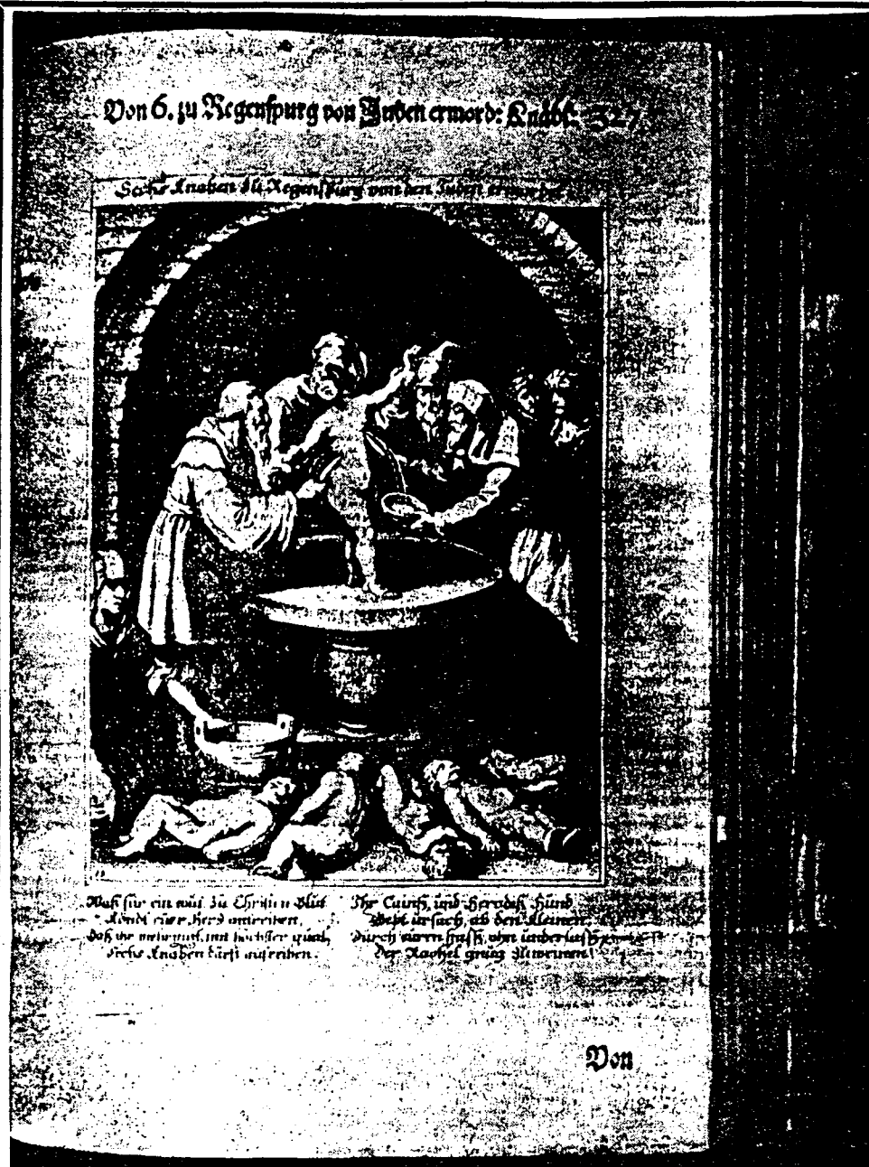
The Ritual Murder at Regensburg in 1476. (Six boys were tortured to death)

blood-stains and discovered the child's body in the Jew's house, lying in a tub. The Jew, however, escaped across the sea. The other murder he saw with his own eyes in Saona, a province of the Republic of Genoa. He stated: My father led me into a house where eight Jews were assembled. They took a sacred oath that they would rather suffer death or kill themselves before they would confess the deed they were going to commit. After that they brought in a two year old Christian child. One Jew held its right arm, another his left arm, and the third one held his head so that he formed the shape of a cross. The fourth violator had a long, sharp, pointed needle or scalpel in his hand. With it he stabbed the child from his stomach to the heart. He quickly pulled the needle back and stabbed once more so that the blood began to flow freely from the wounds into a basin held beneath. This was