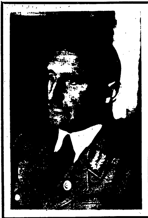
(Ziegler, Schauplatz p. 396 col. 1,2. Eisenmenger, entdecktes Judentum II, p. 219)

1349. The Jews wanted to attack and kill the Christians assembled in their church at Rothenburg. A Jew's maidservant exposed the Jewish murder plot, and the Christians stormed out of their church and killed all the Jews.