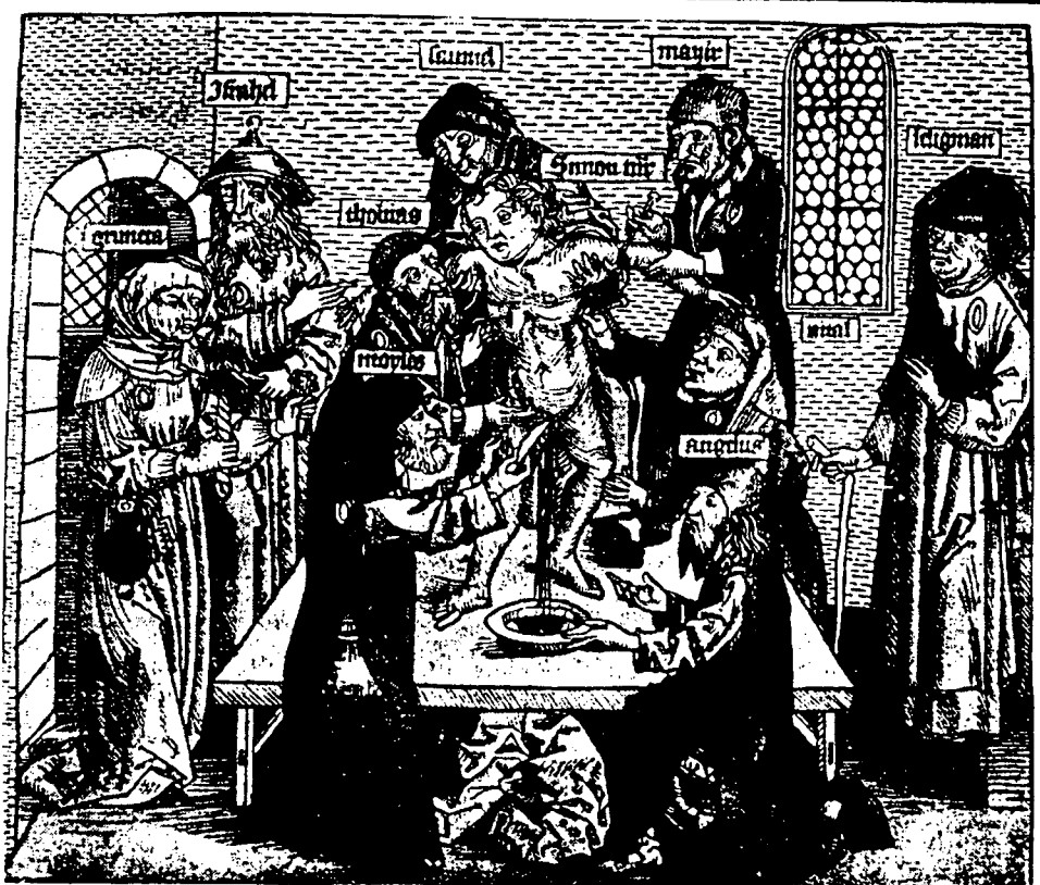
The Ritual Murder of St. Simon of Trent in 1475 (woodcut from that period of time)

Ritual murder at the time of the Passover is similar in certain respects to the Purim feast. The Purim feast commemorates the day of the