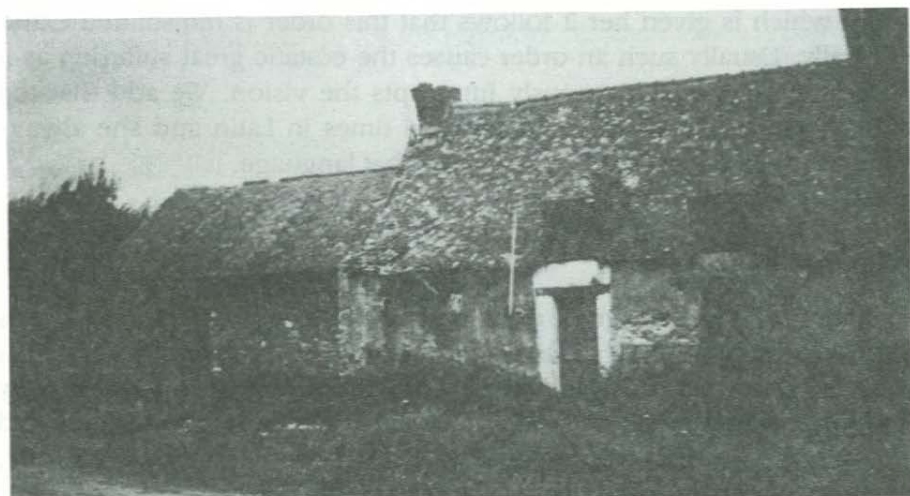
The front of the cottage