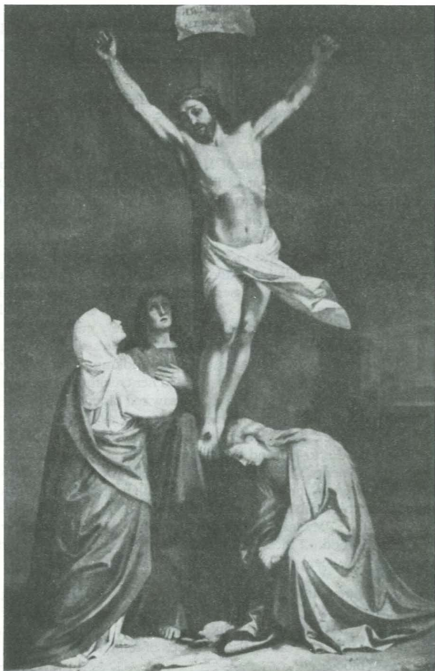
The picture of Calvary which bled