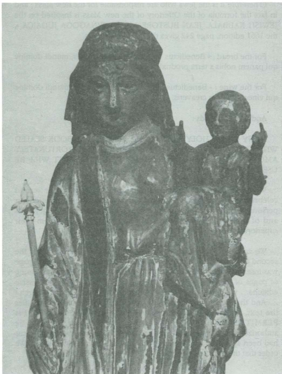
The miraculous statue of Our Lady of Bonne Garde