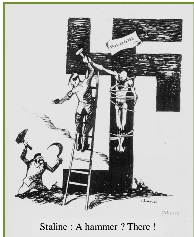
Staline : A hammer ? There !

- There were three nations all in all, came the reply. But there are only two and a half left. The third [understand: Italy] was cut in half. Its northern part is still expansionist while its southern part is a great and good democratic nation.