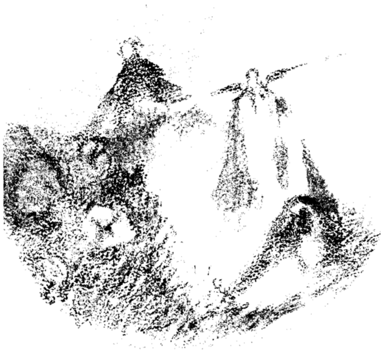
In this pastel sketch by Rudolf Steiner, the working of cosmic forces into the still heavy and mist-laden atmosphere of Atlantis is shown as guided by god-like angelic beings. Out of the downward streaming colours are born the types of the lion, cow, and bird (left), while to the right a kind of cave unfolds inner life and form. (Preliminary sketch for the large cupola of the Goetheanum ceiling, Dornach, Switzerland).

matured in order to develop an inner consciousness of self. At length, the fourth age arrived. At this stage something of tremendous importance took place, which had been prepared by all that had previously happened.