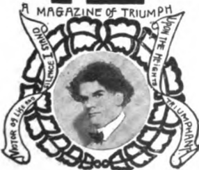
The Ancient Symbol of Good Fortune.